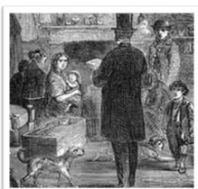
A census enumerator in a Gray’s Inn Lane tenement, London